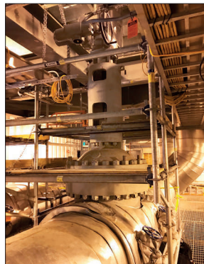
Gasket replacement on a 30" Velan bolted bonnet gate valve