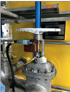
Installation of limit switches