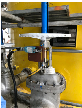
Installation of limit switches